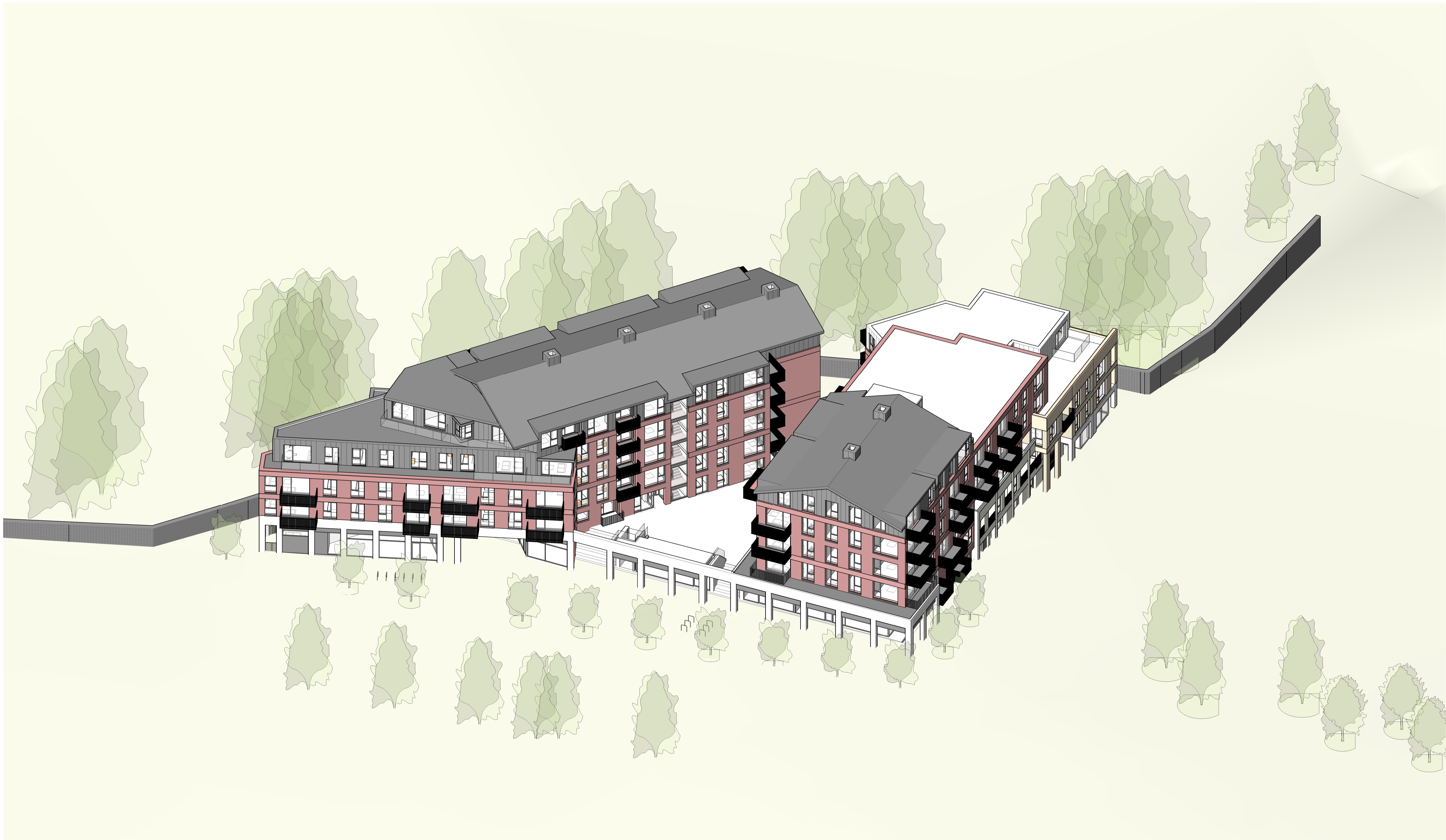
Proposed 3D View - South East