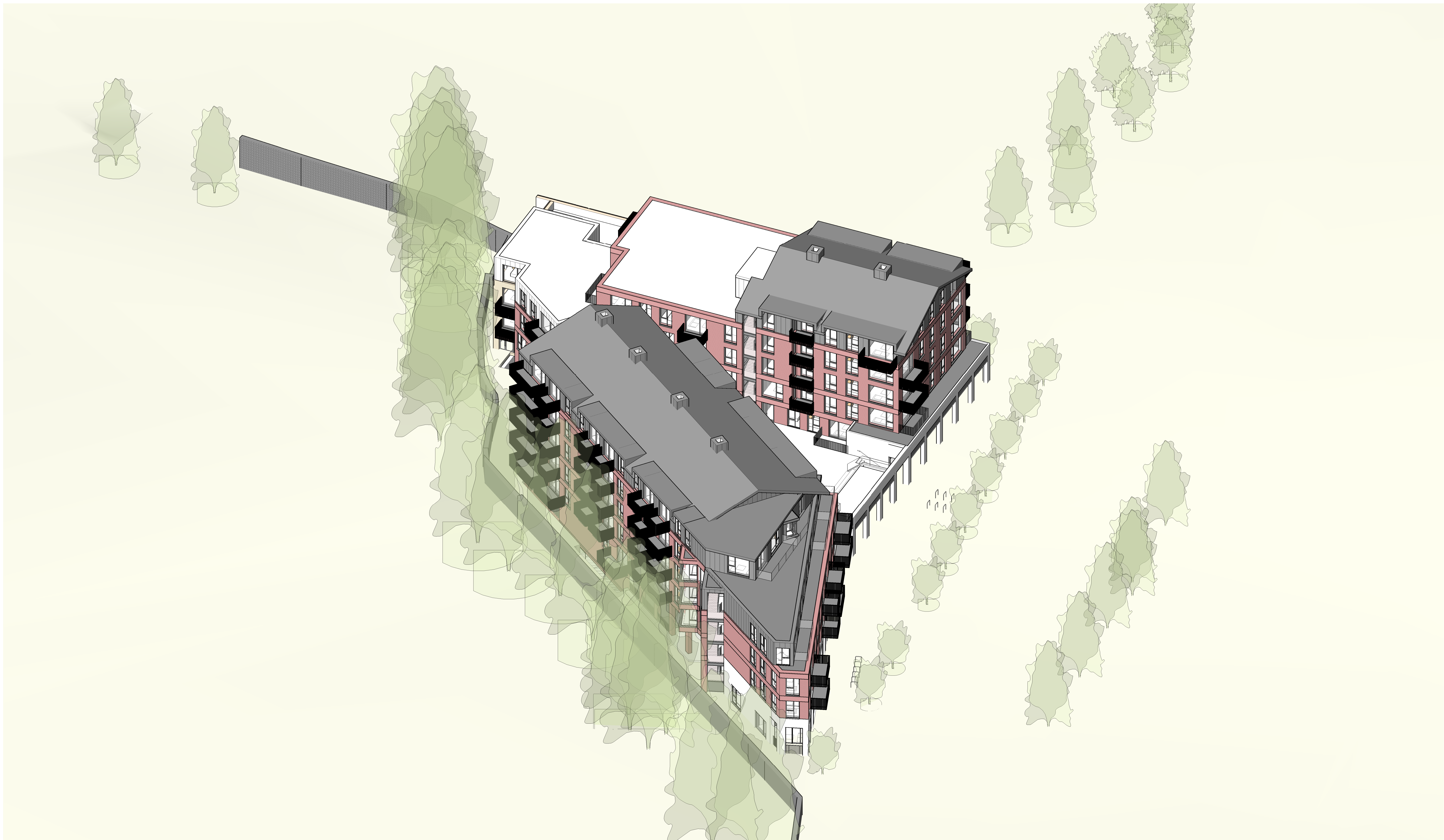
Proposed 3D View - South West